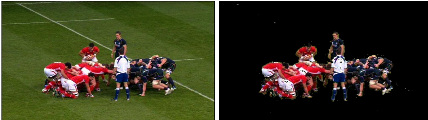
Figure 1: Images before (left) and after (right) background subtraction.

In order to detect and remove the pitch we employ a technique similar to chroma-keying to remove the green component from the image. Our method here closely follows the approach of [7] for pitch tracking over multiple frames for broadcast purposes. Within each image we histogram the hue values of pixels and remove the pixels that belong to a small neighbourhood around the largest peak of the histogram. This technique is sufficient for our purposes even though it fails to remove other artefacts, such as sponsor logos on the pitch, we are not interested in and have no effect on subsequent classification. Examples of the background removal are shown in Figure 1. An exemplar histogram of the hue values in a typical image is shown in Figure 2, with a distinct peak in the green section of the colour space.