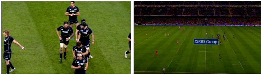
Figure 4: Example frames from a typical footage, close zoom (left) and far zoom (right).

In our preliminary experiments (the focus of this work) we focused on two games, Wales V Scotland for training and Wales V France for testing. Due to the broadcast nature of the footage, the game is captured from several cameras. However, we use only footage from single camera that covers the primary action rather than focusing on specific players or wide-angle views (see Figure 4).