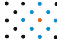
Fig. 2 Points with equal Manhattan distance

Using the Euclidean distance for d(i, j) tends to produce hexagonally distributed tile centers, corresponding to a dens-