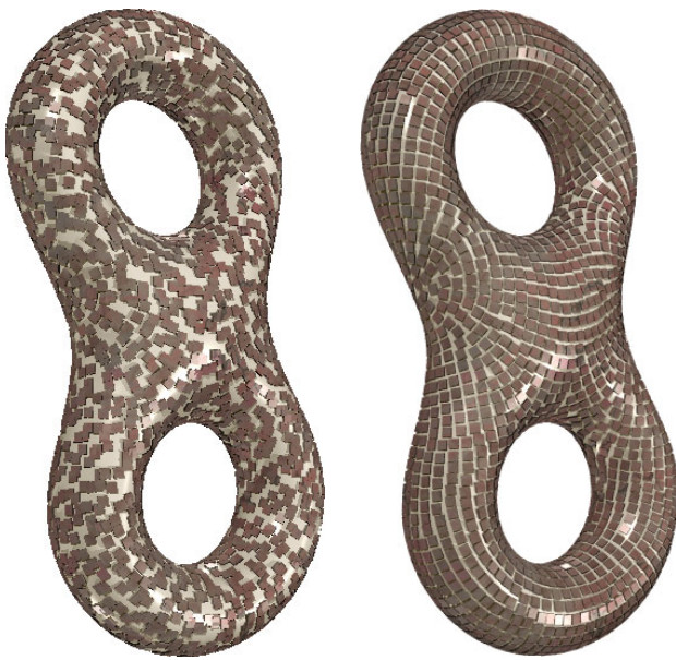
Fig. 4 Mosaic tiling on genus-2 ‘eight’ model. Left: initial placement of 3,000 tiles. Right: final positions of these tiles.

These examples took from 2 to 10 minutes to compute, using a Pentium IV 2.4GHz CPU, given meshes containing 50,000 triangles and placing about 10,000 tiles.