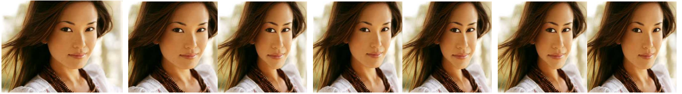
Figure 3. Three check point pairs. In (b) and (c), retargeted images on the left are obviously better than those on the right. In (d), the retargeted image on the right is obviously better than the one on the left.