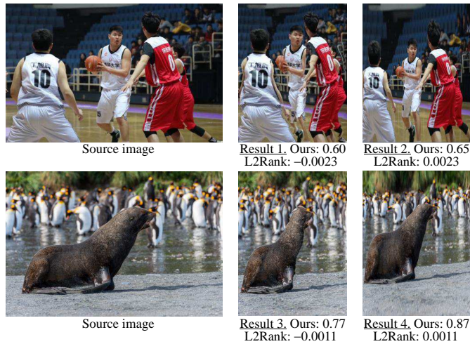
Figure 4. Two examples not in RetargetMe are illustrated, each of which has two retargeting results. Result 4 is obviously better than Result 2 because human observers are more sensitive to the change of human subjects. The scores predicted by our method provide a correct reference (0.87 > 0.65), while the scores predicted by L2Rank are in the wrong order due to cross source (0.0011 < 0.0023).

six (without Q_3 , Q_6 and Q_8 ) from nine metrics in Section 3.1. Our method can evaluate retargeted images with difference sources (Figure 1), while L2Rank can only evaluate retargeted images with the same source; see the visual comparison of two examples in RetargetMe (Figure 1) and two examples not in RetargetMe (Figure 4). In addition to this significant difference, below we show that even for retargeted images with the same source, our method has higher Kendall correlation coefficient \tau (indicating better agreement with subjective voting) than L2Rank.