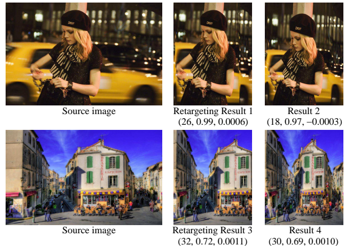
Figure 1. Subjective scores are only comparable for retargeting results of the same source image. In each row, two retargeting results are presented and their scores are shown in parentheses (the first numbers). These subjective scores provided in the RetargetMe benchmark [18] are numbers of votes that people cast when comparing this image against other images with the same source image. Higher scores mean better results. Although the scores of the two retargeting results 3 and 4 are higher than the scores of results 1 and 2, we cannot conclude that the results 3 and 4 are better than the results 1 and 2; instead, the opposite appears to be true. The second numbers in parentheses are objective scores output from the method proposed in this paper. The scores not only preserve the ranking of retargeted images with the same source image, but also provide a reference to compare retargeted images from different sources. As a comparison, the third numbers in parentheses are objective scores predicted by [3], which cannot compare retargeted images from different sources.

Existing OQA methods train a model using some benchmarks (e.g., [18], [12]) — in which subjective scores evaluated by users are provided — and the absolute subjective scores of all retargeted results from different source images are used indistinguishably for training. A key observation that motivates the work presented in this paper is that in most cases, the subjective scores of retargeted images are only meaningful with the same source image. Even for human subjects, it is often difficult to give consistent scores for retargeting results of different sources (diff-source-results). An example is shown in Figure 1, in which the two retargeting results 1 and 2 have lower subjective scores, but appear to be more plausible than the results 3 and 4 that